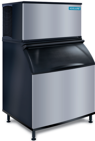
Koolaire KT-1700 Ice Kube Machine on K970 Bin

Koolaire by Manitowoc ice machines are designed, developed and tested by Manitowoc engineers to provide great ice production, energy efficiency and reliable service at an affordable price.